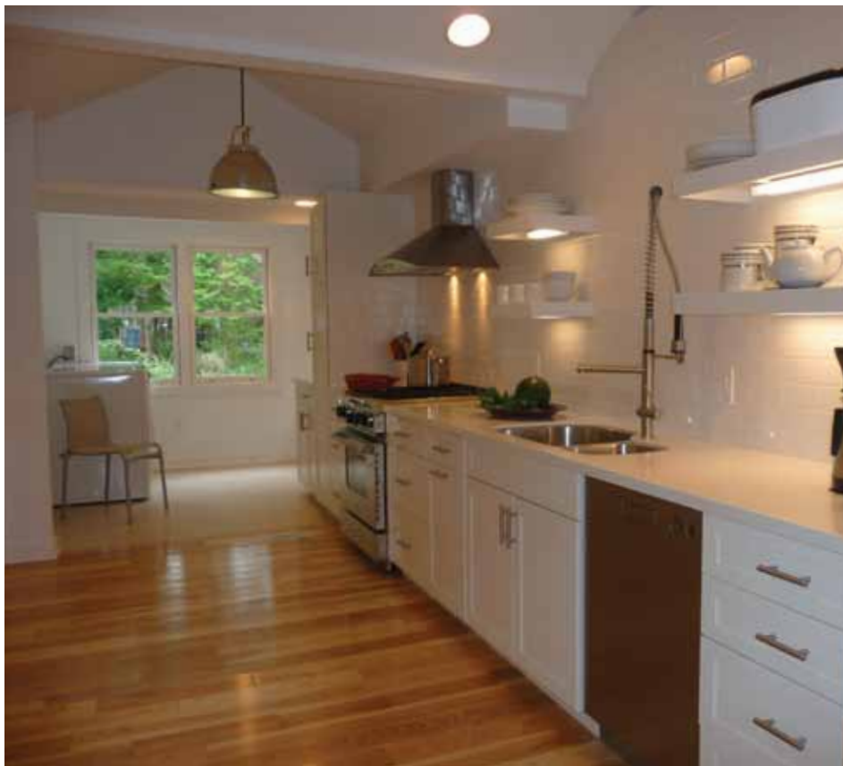
GIORGI KITCHENS & DESIGNS, DESIGNED BY OLIVA MINAKOWSKI

Taking it a step further, Feig-Sandoval says that you can suggest fusing high-end and budget-friendly materials. For instance, if the expensive tile is a must-have for the client's backsplash, try designing a backsplash that features a few of the high-end tiles as accents mixed in with a less costly option. Doing so will create impact yet will save several hundred dollars.